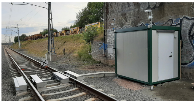
along the line