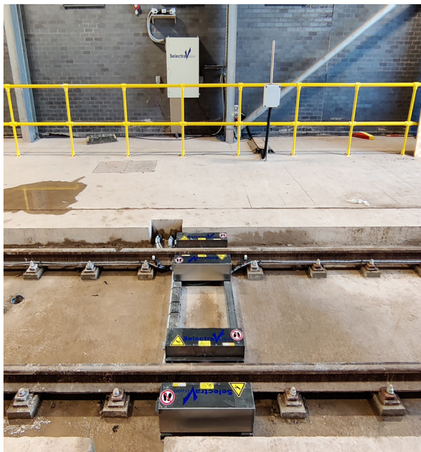
in the workshop